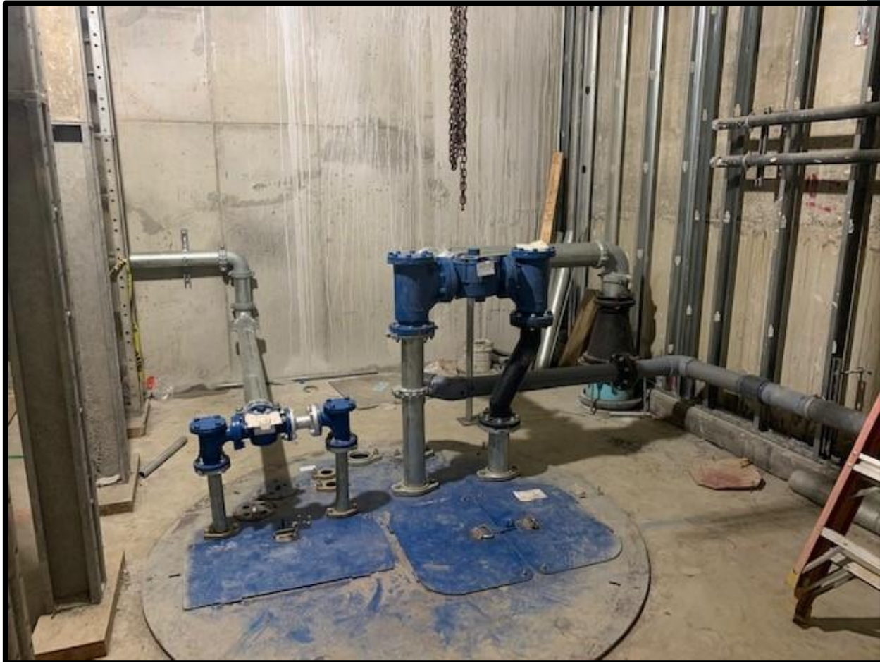
Wetland Cell Pump and Piping Installation