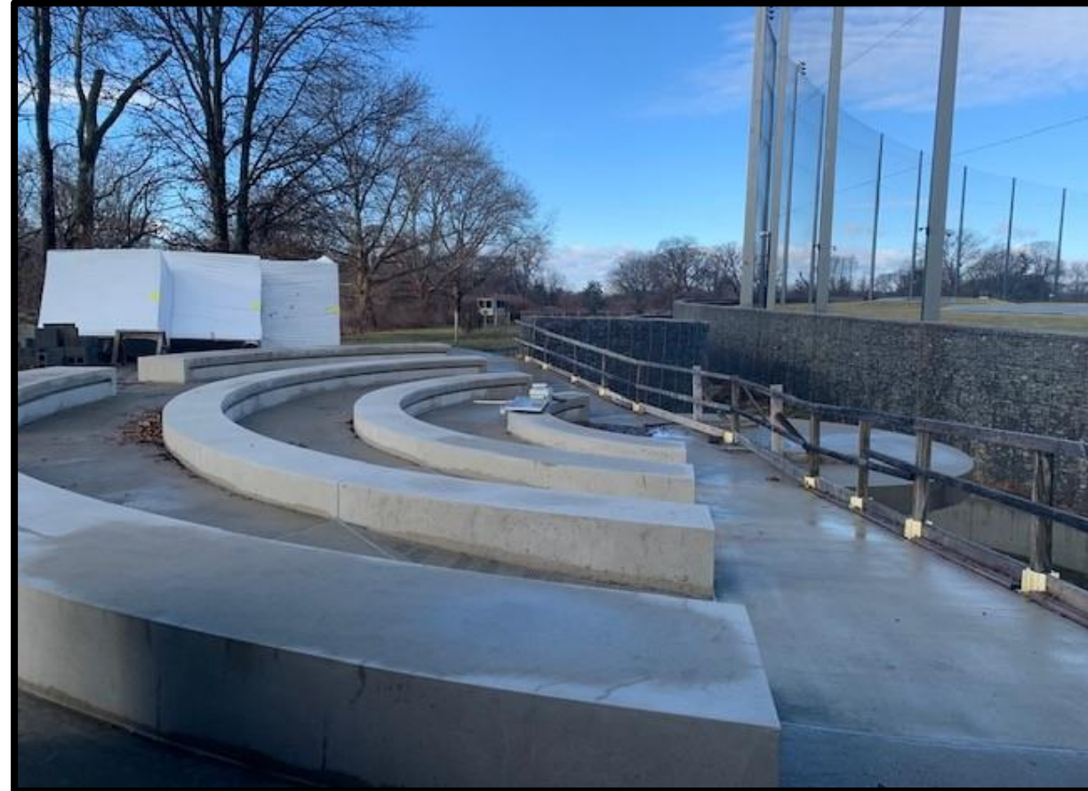
View of current condition of outdoor seating area