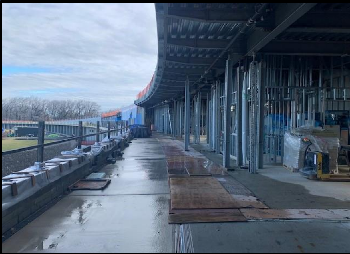
View of current condition of concession area