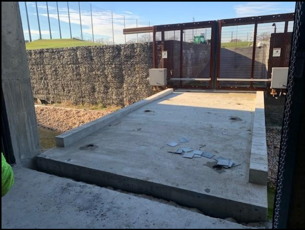
Precast Bridge Installation