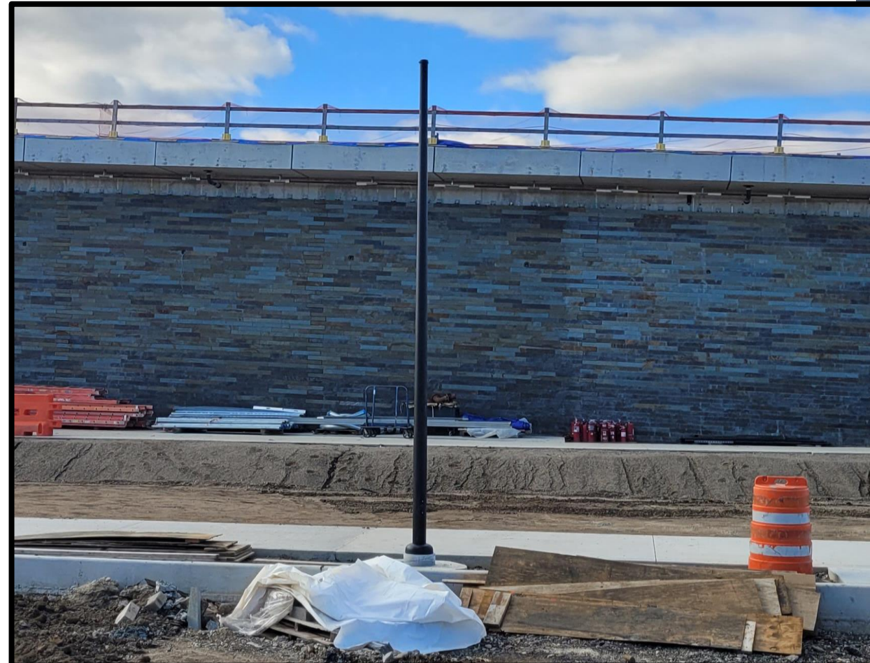
Sidewalk Paving and Site Lighting Pole Installations