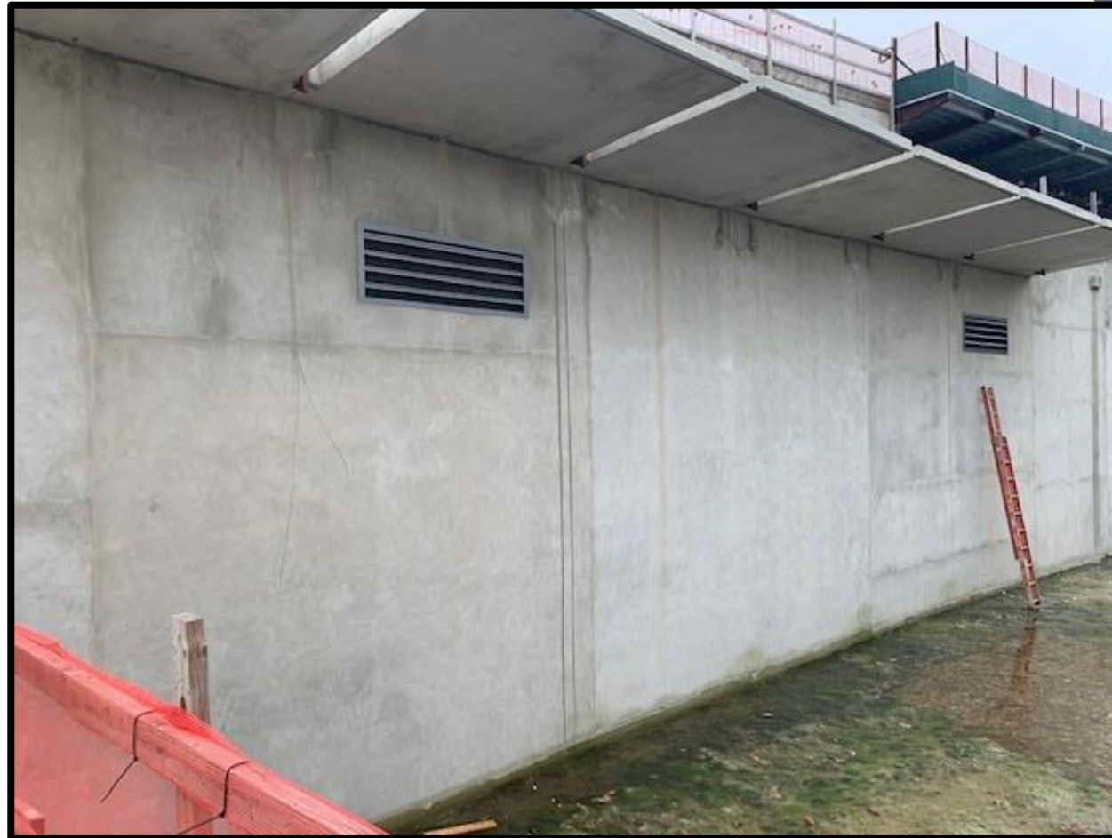
Interior/Maintenance access areas