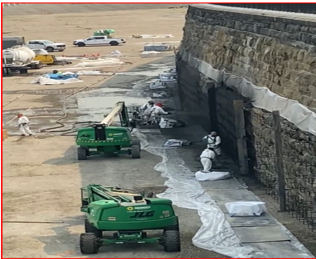
Application of Shotcrete on North Basin East Wall

The Jerome Park Reservoir is a raw water reservoir supplying raw water to the Croton Filtration Plant. The primary purpose of the JRAQ-REH construction contract is to rehabilitate and upgrade components of the Jerome Park Reservoir and to maintain the reservoir in a state of good repair.