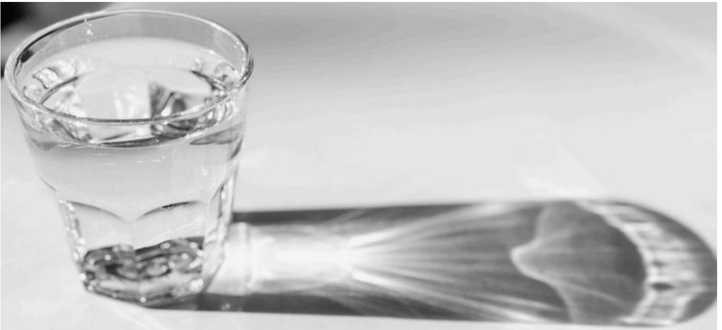
This stuff currently contains fluoride in New York City.