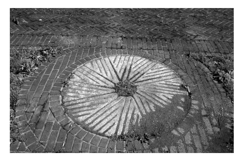
The old mill-stone from the grist-mill that has been mounted at the foot of the staircase south of Van Cortlandt House.

struck by lightning and was destroyed by fire. The sawmill stood in dilapidated condition, being used as a storehouse for the tools of the workmen and for the "stanes" (Scottish for stones) of the curlers , until the spring of 1903, when it was removed by the park authorities. By then it was falling apart and dangerous. Several attempts were made to repair it, but the support beams were so rotten that it was feared that the whole building would fall on the workmen. The old mill-stone from the grist-mill has been mounted at the foot of the staircase leading to the former Colonial Revival Garden to the south of Van Cortlandt House.